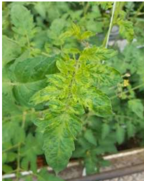
Figure 2: Mosaic symptoms in the young leaves of ToBRFV and PepMV-affected tomato plants (NPPO of the Netherlands, 20191007)