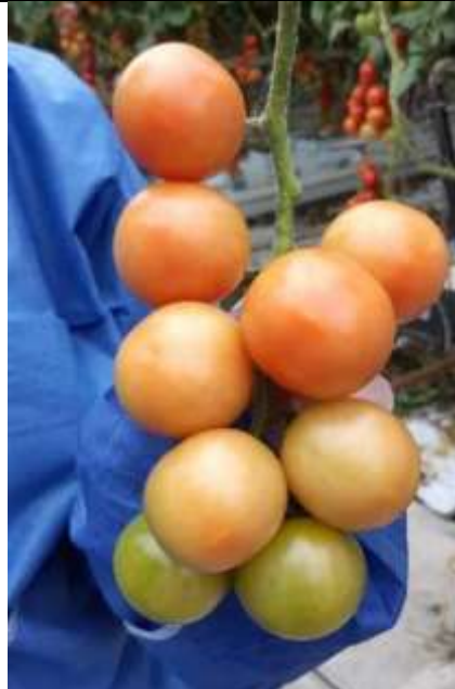
Figure 1: Some fruits of ToBRFV and PepMV-affected tomato plants showed a delay in ripening. (NPPO of the Netherlands, 20191007)